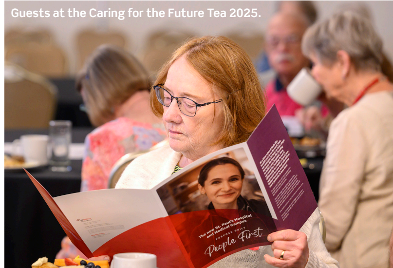
Guests at the Caring for the Future Tea 2025.

We look forward to hosting our Caring for the Future Tea this summer and ask that you hold June 4th, 2026 , in your calendar. We will be in touch in May with an invitation!