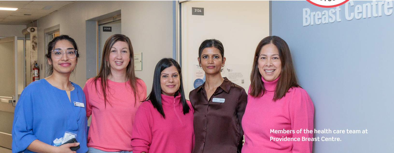
Members of the health care team at Providence Breast Centre.